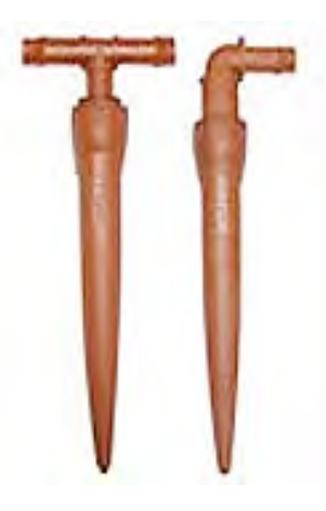
Complete Kit RW15721 $48