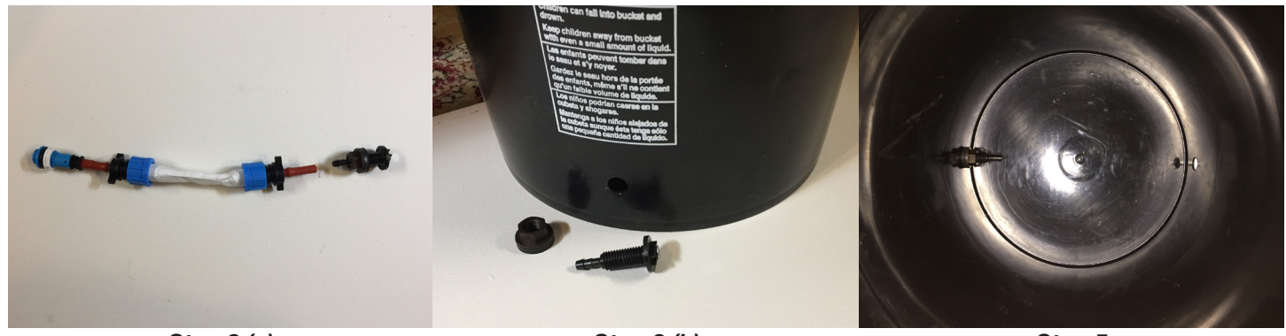
Step 3 (a)