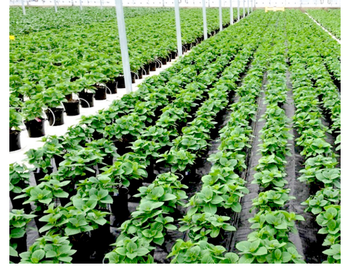
"Seeds have the power to preserve species, to enhance cultural as well as genetic diversity, to counter economic monopoly and to check the advance of conformity on all its many fronts."- Michael Pollan