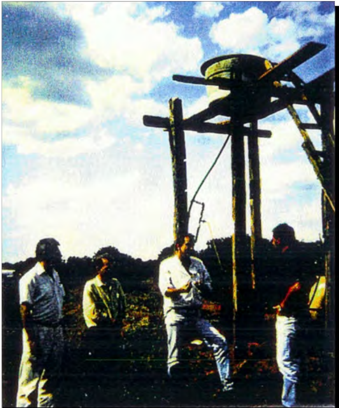
Brazil: Gravity Tank Elevated 10' (J Meters) Irrigating 12 Acres of Coffee