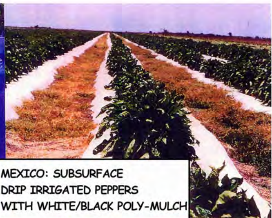
MEXICO: SUBSURFACE DRIP IRRIGATED PEPPERS WITH WHITE/BLACK POLY-MULCH