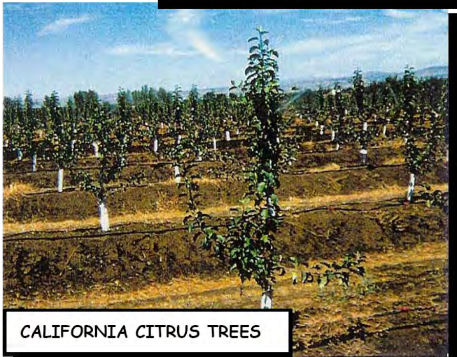
CALIFORNIA CITRUS TREES