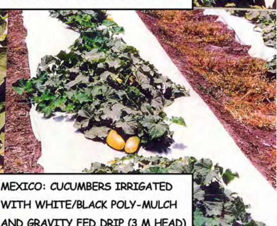
MEXICO: CUCUMBERS IRRIGATED WITH WHITE/BLACK POLY-MULCH AND GRAVITY FED DRIP (3 M HEAD)