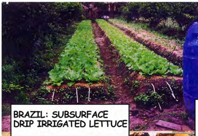
BRAZIL: SUBSURFACE DRIP IRRIGATED LETTUCE

Blumats in the beginning? Not in the same form but the same water push to higher ground, slow gravity flow down, and probable use of clay as the Hanging Gardens of Babylon, one of the Seven Wonders of the Ancient World built by Nebuchadnezzar for his Queen Amytis.